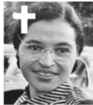
Rosa Parks peacefully protested against racism in the USA during the Montgomery Bus Boycotts by refusing to give up her seat to a white man.